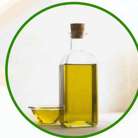
Coldpressed Oils & Ghee