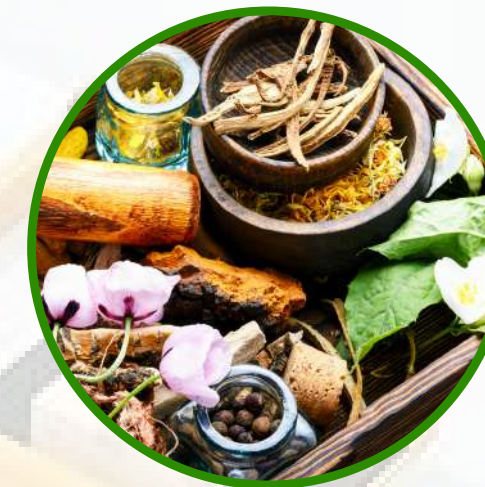
Herbals & Ayurvedic